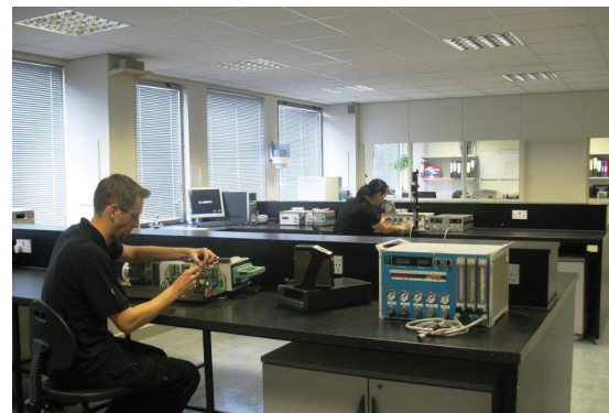
Optident service department facility

There are also several useful accessories that should