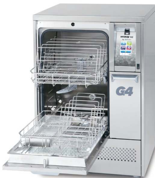
Sci Can Hydrim M2 Washer-Disinfector