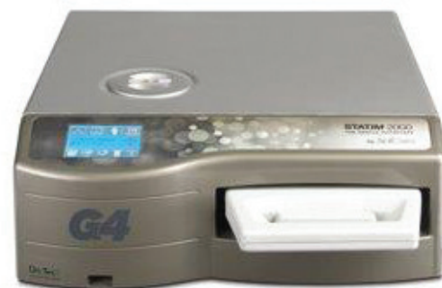
The Sci Can Statim 2000 autoclave

Optident will offer continued technical support and routine servicing options for all Sci Can dental equipment