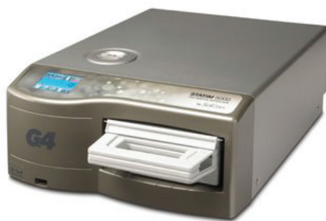
The Sci Can Statim 5000 autoclave

The package offers peace of mind to those dental practices that are looking for high grade equipment with a proven track record, and with the additional benefit of a built-in service guarantee.