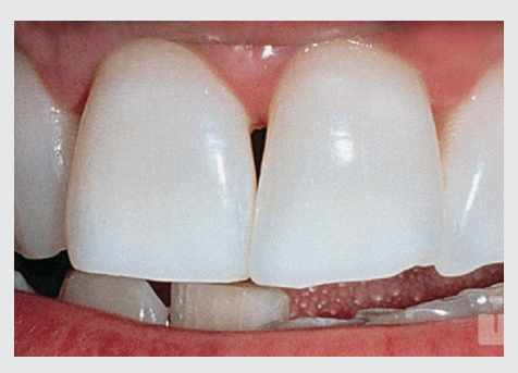
Figure 2b: The same case after whitening with Opalescence

Opalescence possesses an ideal level of viscosity, helping to hold the tray in place, and prevent any swallowing of the gel, regardless of the method of delivery. A choice of regular, mint or melon flavours is available to suit differing tastes, with overnight wear times for 10% carbamide peroxide of approximately eight to ten hours and four to six hours for a 16% gel. Opalescence is theonly sustained release product on the market. The product can also be highly effective in restoring the