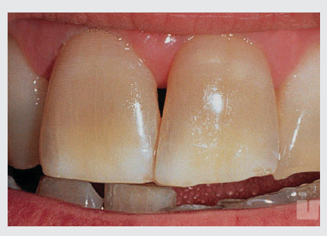
Figure 2a: Tetracycline stained teeth before whitening with Opalescence

In introducing Opalescence to the dental market, Ultradent's aim was to produce a safe and effective product that would protect teeth from dehydration and also increase shade stability. For these reasons, the product takes the form of an aqueous-based gel that is available in two different levels of carbamide peroxide (10 and 16%), with its formulation incorporating potassium fluoride.