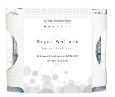
Figure 8: Examples of Optident's bespoke packaging for various private practices. These can be highly effective marketing aids