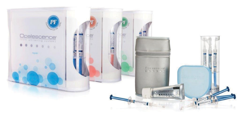
Figure 1: The Opalescence 'take home' whitening kit

Potassium fluoride has been found to contribute to an increase in enamel hardness, the prevention of dental caries and a decrease in tooth sensitivity (Basting et al 2003; Al-Qunaian 2005; Clark et al 2006; Amaechi et al 2006; Browning et al 2006).