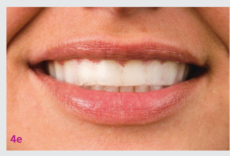
Figures 4a-4e: The ready to use Tres White system. The tray is easily placed, and the outer tray layer is removed, leaving the inner tray in place