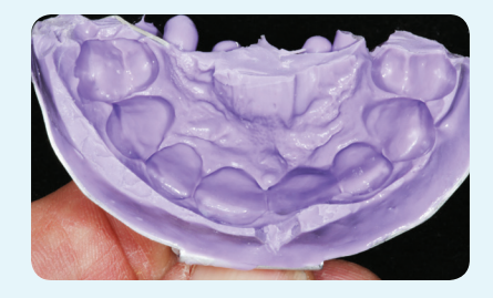
3. After only 30 seconds, remove the tray from the mouth. The result is an accurate and detailed matrix.