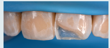
6. A more opaque and high value shade is added mesially (Opaque White) in order to raise value and hide the background.