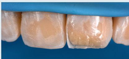
7. The dentinal opaque core body is modeled (A3) according to the polarized picture information.