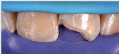
4. The palatal and incisal portions of the tooth can be molded using a palatal silicone matrix.