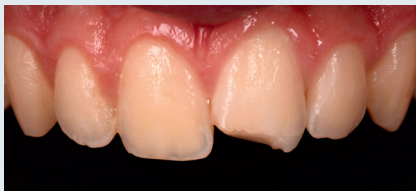
1. Patient with fractured central incisor.