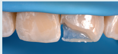
5. Note the two shades of the palatal shell chosen (ET and A2) for their different levels of opacity.