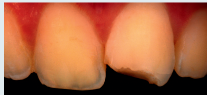
2. A polarized picture is used to outline opacities and translucencies.