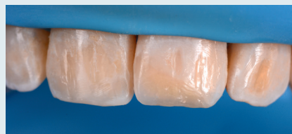
8. The outer layer is formed using a translucent shade (ET) and finishing and polishing are performed.