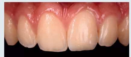
9. Final result after rehydration.