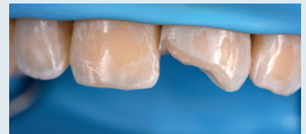
3. Composite shades are chosen; the tooth is prepared after placement of rubber dam isolation.