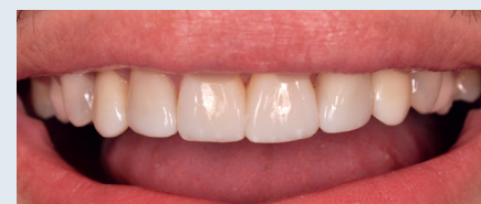
10. Integration between restoration and natural tooth structures resulting in a more harmonic smile.