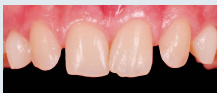
1. Note the presence of both deciduous upper canines and many dental diastemas due to the agenesis of the permanent counterparts.