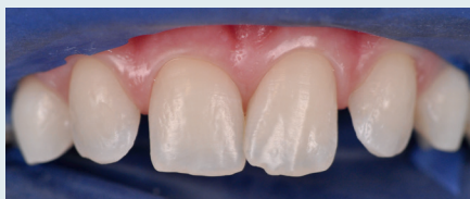
6. Modified rubber dam isolation. Note the highly reflective white enamel.