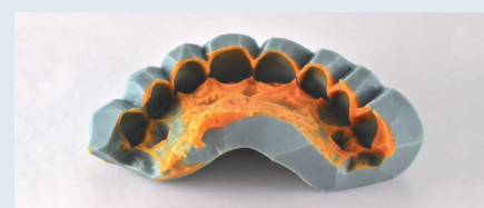
3. Mock-up silicone guide.