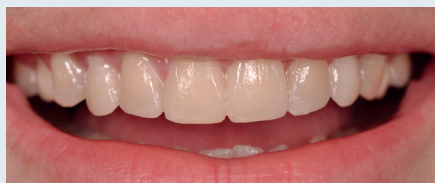
5. Intraoral mockup made with ExperTemp® temporary crown and bridge material.