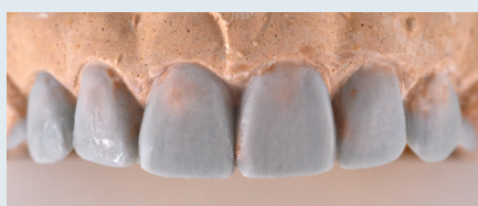
2. Final wax-up, following proper esthetic proportions and occlusion requirements.