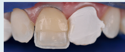
7. Layering of the palatal shell (Enamel White) and dentin (A3 on the cervical followed by A2 on the remaining buccal surface).