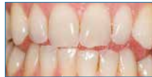
Before Opalescence® PF