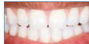
After Opalescence Go®