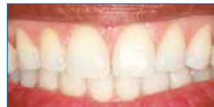
Before Opalescence Go®