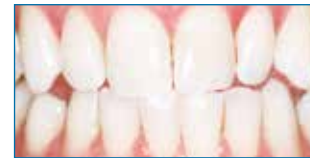
After Opalescence® PF