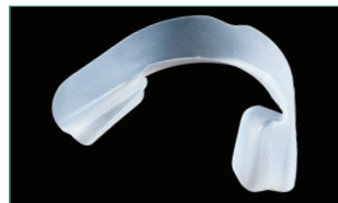
UltraFit tray before