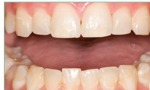
Before Opalescence Go ®