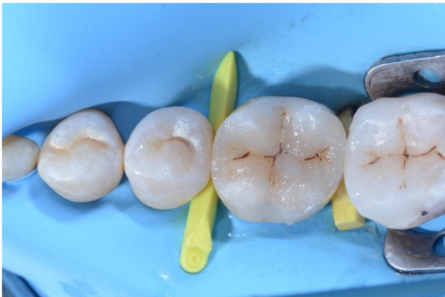
Side view of # 46 after restoration of the distal and mesial interproximal walls.