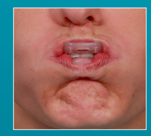
STEP 4. Use the tabs to center the retractor with the patient's mouth.