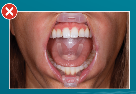
Do not place the tongue guard on top of the patient's tongue.