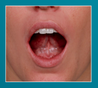
STEP 2. Ask the patient to place the tip of their tongue on the roof of their mouth.