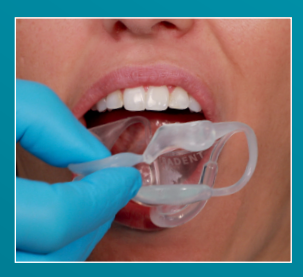
STEP 3. Choose one side of the mouth in which to start, and then comfortably insert the other side of the retractor into the cheek.